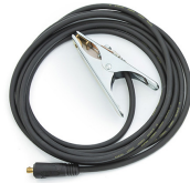
Earth return cable 5 m, 16 mm 2

150A gas cooled + Mech Gas Valve, 4m, Small DIX connector