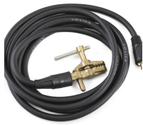
Earth return cable 5 m, 50 mm 2